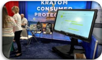
65" Touch Screen Monitor with Floor Stand