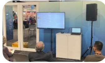
PA System with 1 Speaker and Aux Input Cable