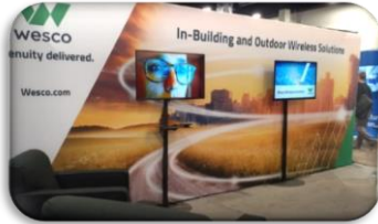
40" HD Monitor with Floor Stand

We'd love to help you design the right solution for your booth! Reach out to us for a free technology consultation.