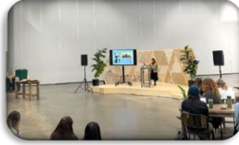
PA System with 2 Speakers, Microphone, and Aux Input Cable