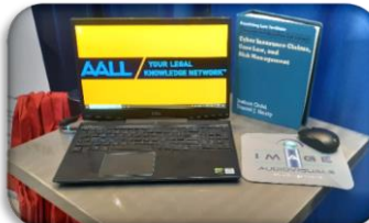
Laptop PC with Windows Suite, Wireless Mouse