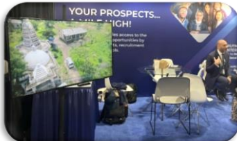
75" HD Video Monitor with Floor Stand